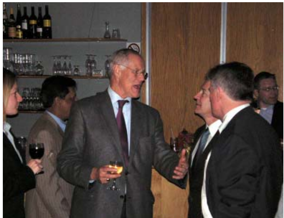
Lots of friendly Liberal faces came out to the February 12 NCFLA fundraiser to thank MP Bill Graham for his excellent service as interim Opposition leader

Canada under the Conservatives is becoming not a leader, but a distant follower, left behind in the environmental technology race of 21 st century. A study by the Pembina Institute found that the Harper government plan would reduce emissions of large emitters by as little as 27 megatonnes in 2010-12, compared to 180 megatonnes under the Liberal plan scrapped by the Tories. Canadians can see clearly which party is prepared to take action to protect our natural environment.